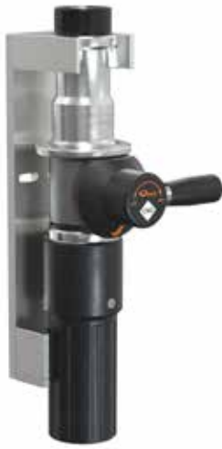
WEH® TK16 CNG with dispenser mounting

Dispenser mountings for safe attachment of the fueling nozzle and high pressure filling/venting hoses in various lengths are available as accessories. Please ask for the lengths needed!