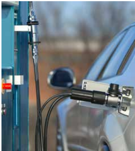
WEH® Nozzle hose assembly with TSA2 CNG