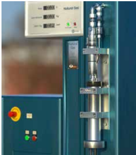
WEH® TSA1 CNG Breakaway Coupling