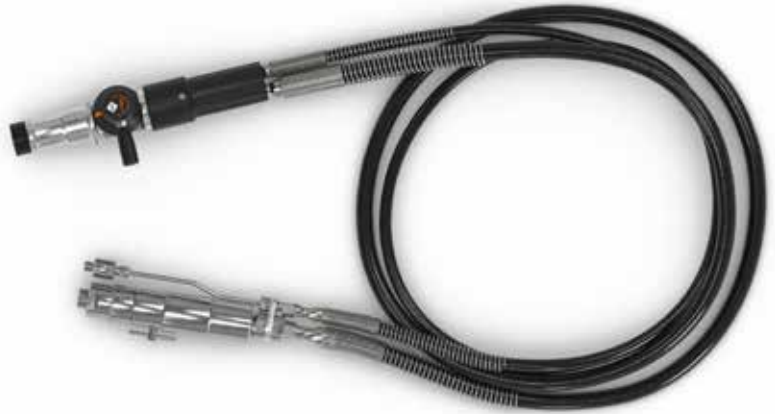
Nozzle hose assembly: WEH® TK16 CNG with filling and venting hose and WEH® TSA1 CNG Breakaway Coupling