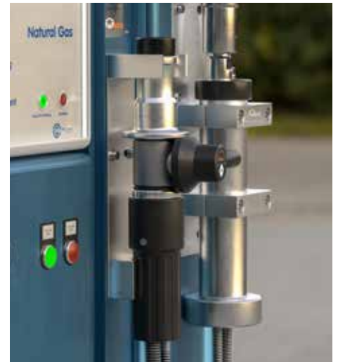
WEH® TK16 CNG with dispenser mounting