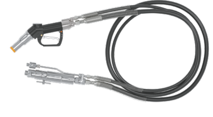
WEH® TK17 CNG with dispenser mounting