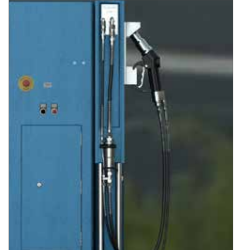
WEH® Nozzle hose assembly