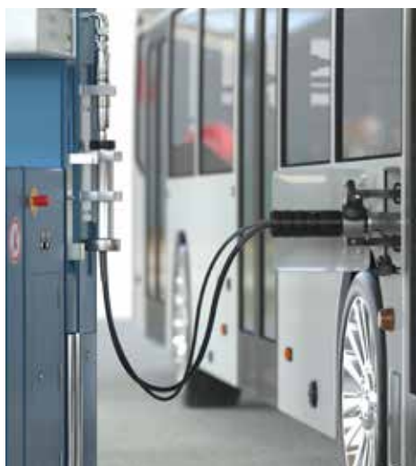
WEH® Hose assembly with TSA5 CNG