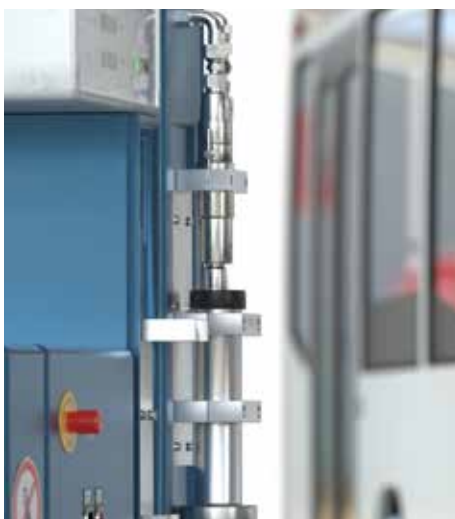
WEH® TSA5 CNG Breakaway Coupling