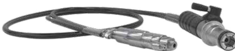
Hose assembly: WEH® TK26 CNG with filling and venting hose and WEH® TSA5 CNG Breakaway Coupling