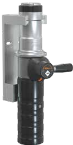
WEH® TK26 CNG with dispenser mounting

Dispenser mountings for safe attachment of the fueling nozzle and high pressure filling/venting hoses in various lengths are available as accessories. Please ask for the lengths needed!