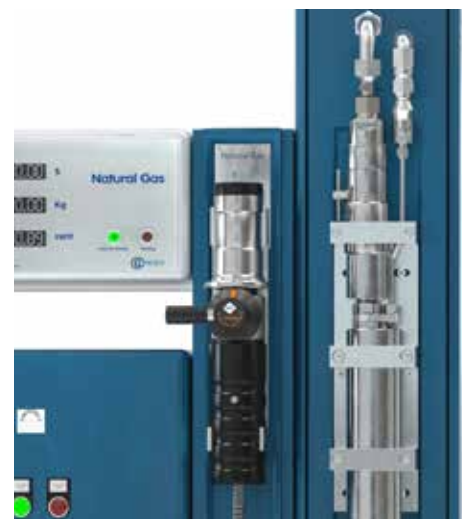
WEH® TK26 CNG with dispenser mounting