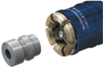
Example of use: